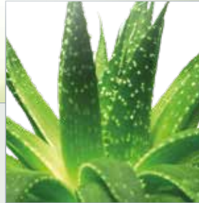
ALOE VERA (>10%)

(Heggie S, et al. Cancer Nurs. 2002; 25(6):442-51)